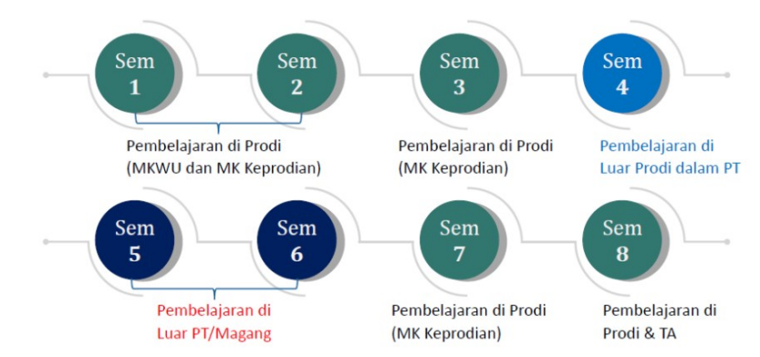
Figure 2. Free Campus Learning Map

Minister of Education and Culture Regulation (Permendikbud) Number 3 of 2020 Article 18 (3) Facilities by Higher Education in the Learning process as referred to in paragraph (1) letter b are as follows: a. at least 4 (four) semesters and no longer than 11 (eleven) semesters are Learning in the Study Program; b. 1 (one) semester or the equivalent of 20 (twenty) semester credit units is Learning outside the Study Program at the same tertiary institution; and c. A maximum of 2 (two) semesters or the equivalent of 40 (forty) semester credit units constitutes: 1. Learning in the same Study Program at different tertiary institutions; 2. Learning in different study programs at different universities; and / or 3. Learning outside of higher education. One alternative to dividing semesters in this learning program can be seen in Figure 2 below: