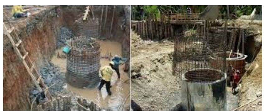
Figure 3. Examples of wells foundations

Volume 10, No. 1, Juni 2021, Halaman 173-182 DOI: http://dx.doi.org/10.32832/astonjadro.v10i1