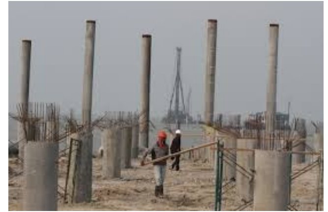
Figure 4. Examples of pile foundations