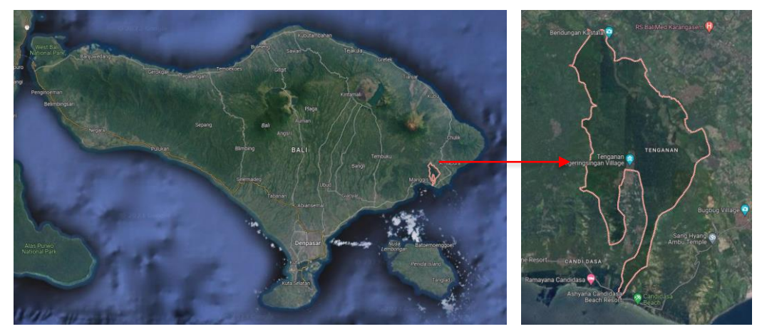
Figure 1. Location of Tenganan Pegringsingan Village.

This research was conducted in 2023 by discussing a Bali Aga village, namely Tenganan Pegringsingan Village which is located in Manggis District, Karangasem Regency, namely Tenganan Pegringsingan Village. Conducted with a qualitative approach, this research involved the indigenous people of Tenganan Pegringsingan Village as informants. This research method is by indepth interviews and documentation, while the techniques used are recording and recording techniques. The research instrument used was a recorder to record the voices of the sources and a picture taker to collect documentation, as well as notebooks to record the results of the discussion. Data from informants will be analyzed and presented in an informal way in the form of narrative analysis. The benefit of this research is to provide insight into settlement patterns in Tenganan Pegringsingan Village.