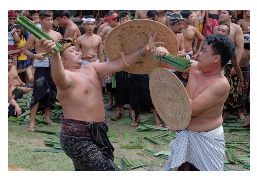
Figure 4. Pandan war.

Volume 13, Issue 1, February 2024, pp.067-073 DOI: http://dx.doi.org/10.32832/astonjadro.v13i1