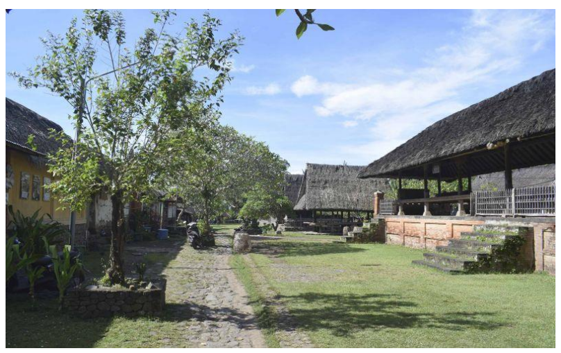
Figure 3. Village clouds.