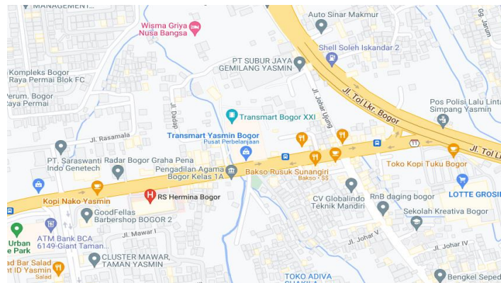
Figure 1. Map of research location in front of Hermina Hospital, Bogor

The place and location of this research is in front of RS Hermina Bogor, Jl. Abdullah Bin Nuh Yasmin and including the National road.