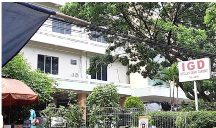
Figure 2. Location in front of Hermina Hospital, Bogor