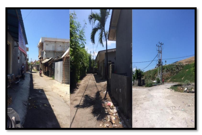
Figure 4. Environmental Road Conditions in Suwung TPA Slum Settlement (Observation Results, 2020)