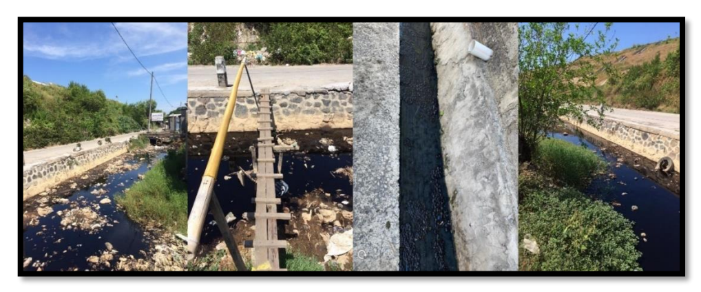
Figure 5. Drainage Conditions in Suwung TPA Slum Settlement (Observation Results, 2020)