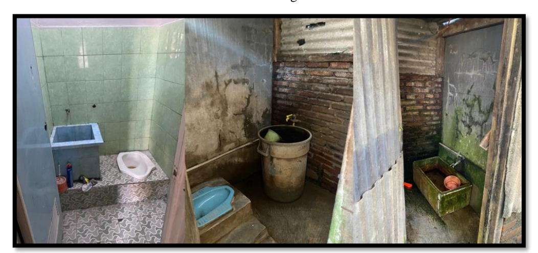
Figure 6. Wastewater Management Conditions in Suwung TPA Slum Settlement (Observation Results, 2020)

The condition of wastewater management in settlements is quite good and most residential buildings use private toilets. Some dwellings dispose of their household waste water carelessly. This can be seen from the absence of a drain for used dishwashing water that does not meet standards.