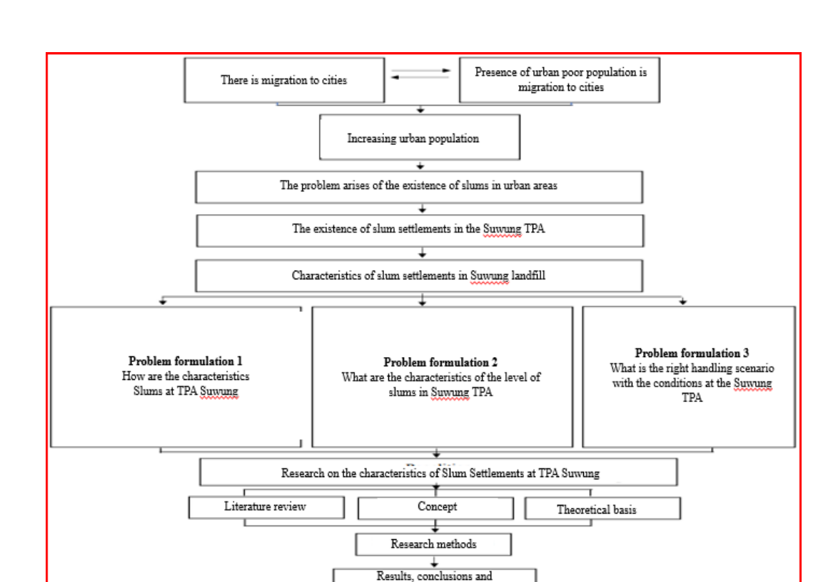
Figure 2. Thinking Framework (Analysis Results, 2021)

Validity testing is used to measure the validity of the questionnaire through a comparison between the calculated r value and r table with degree of freedom (df) = n-2, where n is the total sample. If r count > r table, the statement is declared valid and vice versa (Imam Ghozali, 2011). Reliability testing is used in measuring the questionnaire which is nothing but a variable or construct indicator. A construct or variable is called reliable if it produces a Crobach Alpha value exceeding 0.70 (Imam Ghozali, 2011).