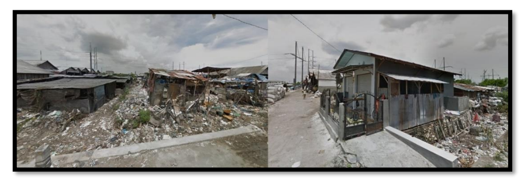
Figure 3. Occupancy at the Research Site (Observation Results, 2020)

The slums in Suwung TPA are dominated by buildings with uninhabitable conditions. The condition of buildings like this is often found on the eastern side of the Suwung TPA. The meaning of uninhabitable is housing that does not meet building safety standards, semi-plastered house floors, buildings with semi-permanent conditions, building roofs using asbestos and zinc, small and crowded buildings inhabited by many people, building density ranging from 70%-60%, and inadequate building health. Another characteristic of residential buildings in this area is the use of electric lighting from PLN with a power of 900 watts and illegal land status. Slums in Suwung TPA also have several areas with characteristics of adequate and livable residential buildings that meet building standards located on the west side of the Suwung TPA area.