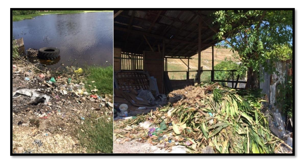
Figure 7. Waste Management Conditions in Suwung TPA Slum Settlement (Observation Results, 2020)