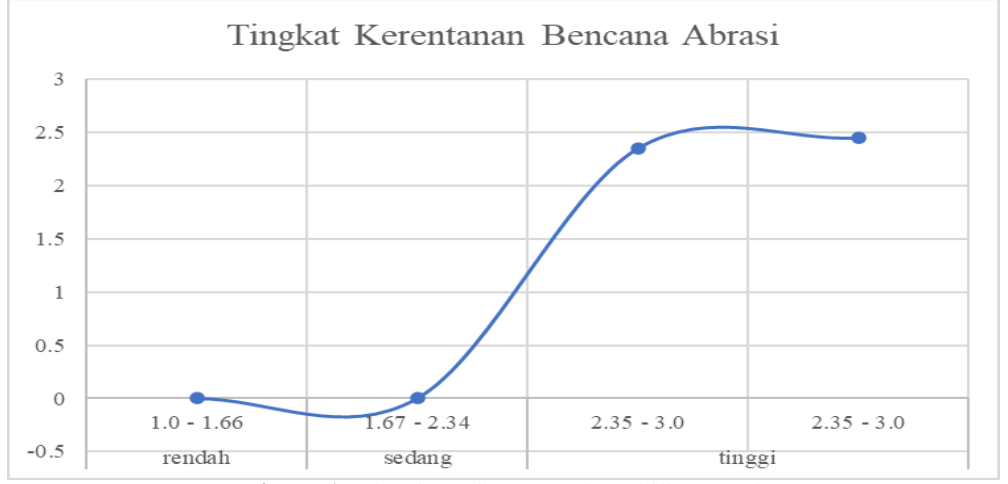
Figure 1. Abrasion Disaster Vulnerability Level

Classification of the level of vulnerability of coastal areas to the threat of coastal abrasion, illustrates that the coastal area of North Galesong District has the same level of vulnerability. Based on the results of the overall analysis, the village/kelurahan vulnerability in North Galesong District is in the high category. The area vulnerability map is shown in the following figure