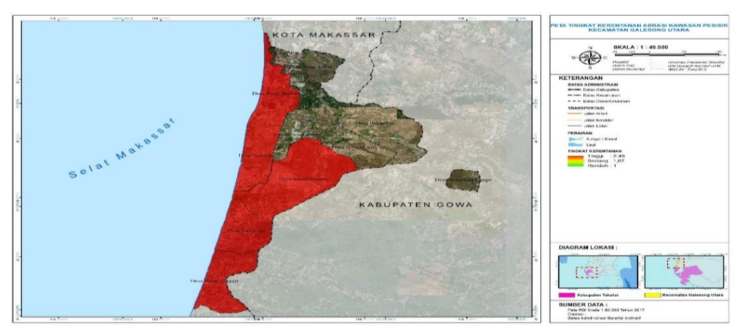
Figure 2. Abrasion Disaster Vulnerability Level

Classification of the level of vulnerability of coastal areas to the threat of coastal abrasion, illustrates that the coastal area of North Galesong District has the same level of vulnerability. Based on the results of the overall analysis, the village/kelurahan vulnerability in North Galesong District is in the high category. The area vulnerability map is shown in the following figure