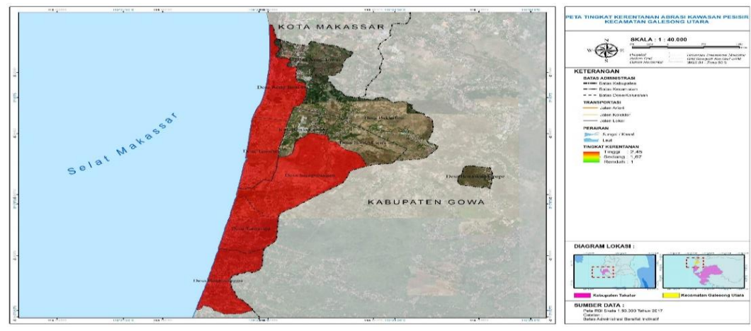
Figure 2. Abrasion Disaster Vulnerability Level

Classification of the level of vulnerability of coastal areas to the threat of coastal abrasion, illustrates that the coastal area of North Galesong District has the same level of vulnerability. Based on the results of the overall analysis, the village/kelurahan vulnerability in North Galesong District is in the high category. The area vulnerability map is shown in the following figure