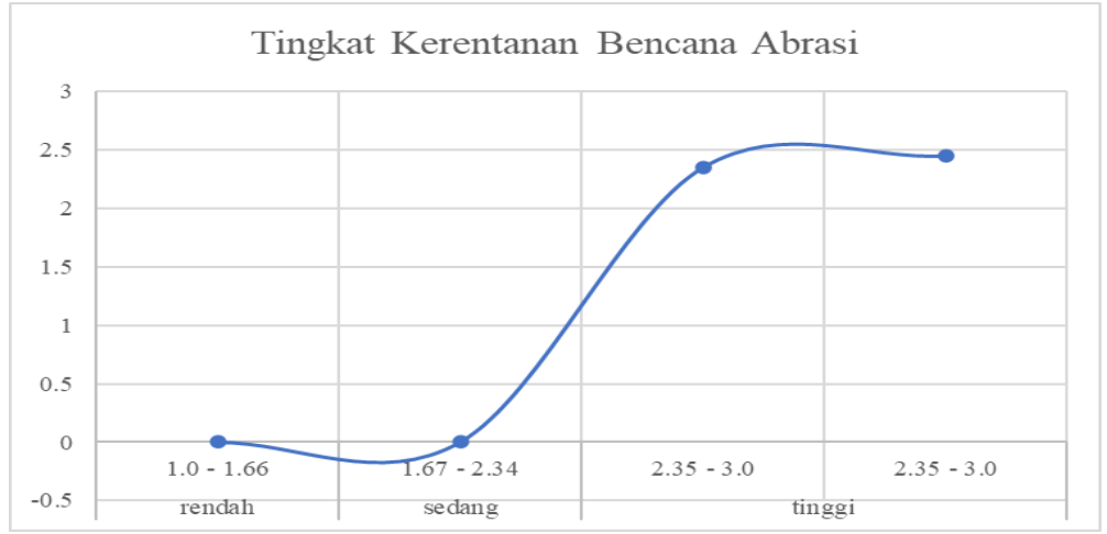
Figure 1. Abrasion Disaster Vulnerability Level

Classification of the level of vulnerability of coastal areas to the threat of coastal abrasion, illustrates that the coastal area of North Galesong District has the same level of vulnerability. Based on the results of the overall analysis, the village/kelurahan vulnerability in North Galesong District is in the high category. The area vulnerability map is shown in the following figure