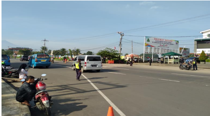
Figure 2. The location is in front of the SMA Taruna Terpadu Boash Salabenda