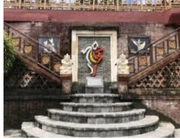
Figure 4. Access to Kumbasari Tukad Badung Park