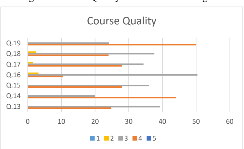
Figure 3. Course Quality on Blended Learning

The assessment findings indicate that while blended learning is generally well-received, there are certain areas that could use some further work to reach the same level of excellence as the rest of the course. The results can be used to further tailor the blended learning experience to individual students' requirements and to increase the likelihood of positive learning outcomes