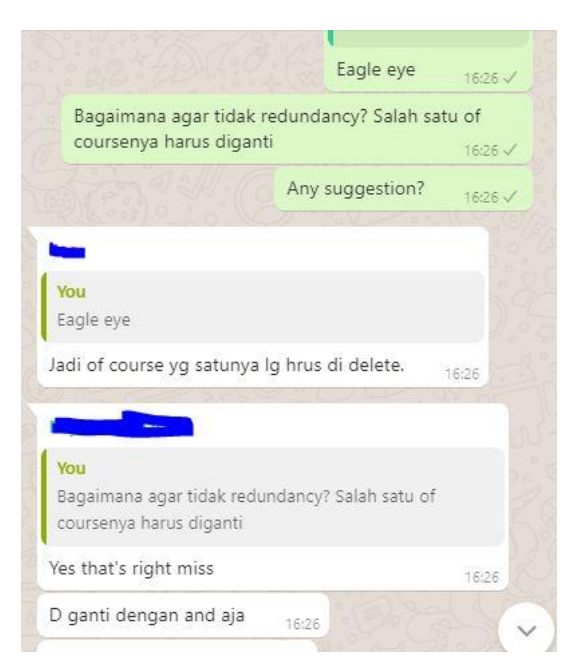
Figure 2 Scaffolding Process