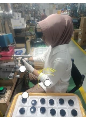
Figure 2. The Angular position of the forearm

Based on the results of angle meter measurements on workers in the Assembly and Decoration (AD) section, it is known that the movement of the worker's forearm when working is at an angle of 58° so the resulting RULA score is 2.