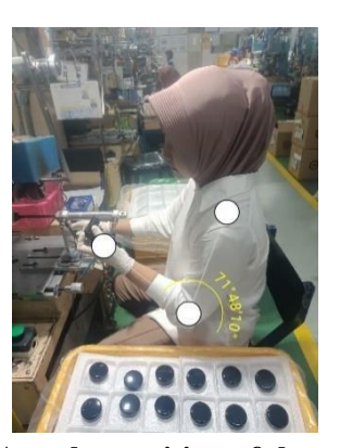
Figure 1. Angular position of the upper arm

Based on the results of angle meter measurements on workers in the Assembly and Decoration (AD) section, it is known that the movement of the worker's upper arm when working is at an angle of 71° so the resulting RULA score is 3.