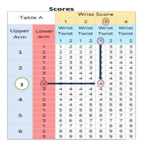
Figure 4. Table A RULA