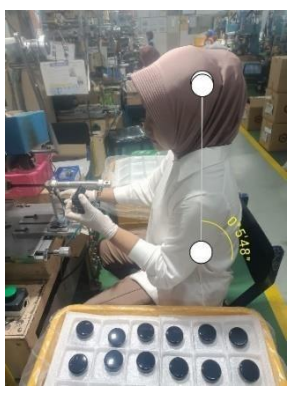
Figure 6. Position of the back angle

Based on the results of angle meter measurements on workers in the Assembly and Decoration (AD) section, it is known that the worker's back when working is at an angle of 0^{\circ} so the resulting RULA score is 1.