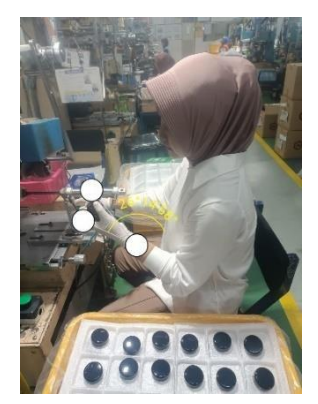
Figure 3. The angular position of the wrist

Based on the results of angle meter measurements on workers in the Assembly and Decoration (AD) section, it is known that the movement of the worker's wrist when working is at an angle of 26^{\circ} so the resulting RULA score is 3.