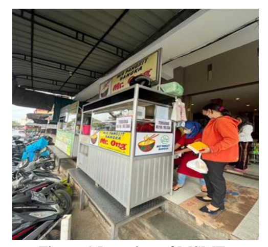
Figure 1 Location of MSMEs

ISSN: <u>2654-8623</u> E-ISSN: <u>2655-0008</u>