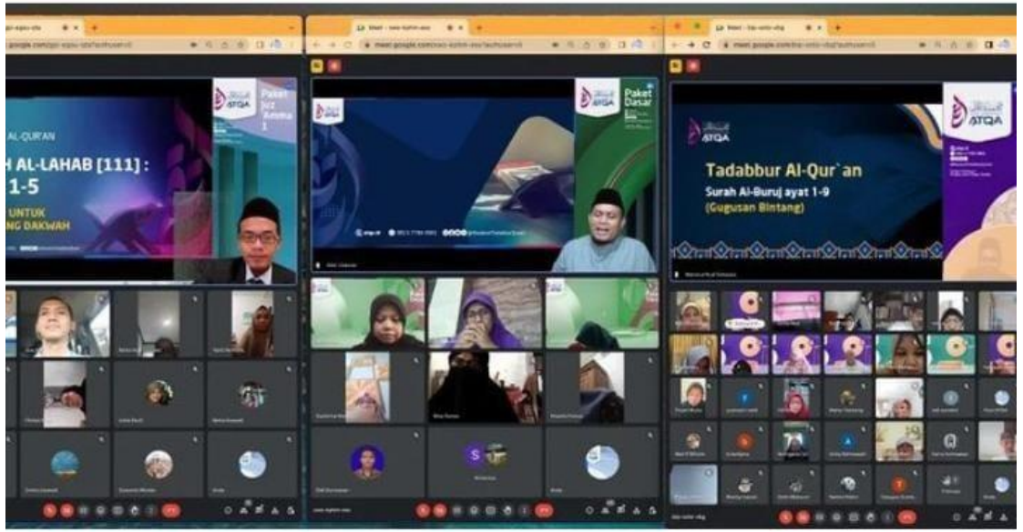
Figure 1. Utilization of Google Meet and OBS

In Figure 1, ATQA teacher uses learning media such as Google Meet and OBS. Google Meet is a medium that builds two-way interaction between teachers and students. Next, OBS can help the teachers to display the learning subjects.