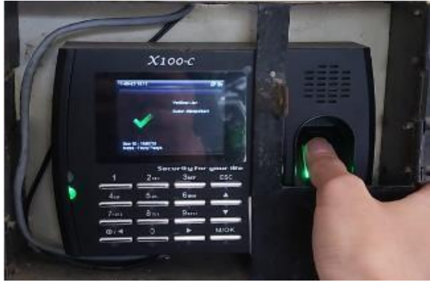
Figure 1. Finger print machine used by students