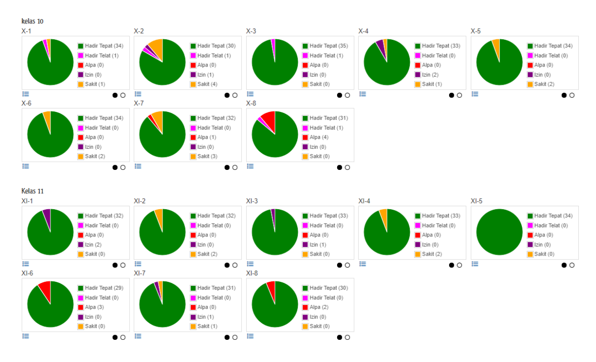
Figure 2 Example of student attendance chart read by the system